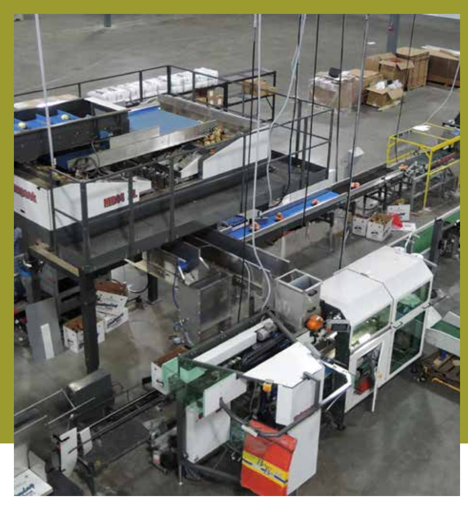
The Manter Control provides all machines with power, communicates with all machines and enables inter-machine communication.

Manter machines, such as a weighing machine, a Clipper, a Wicketbagger, a box packing machine, the MBP-SAB semi-automatic bagging machine, a CheckWeigher, a Baler and a palletiser. To individually set all of these machines